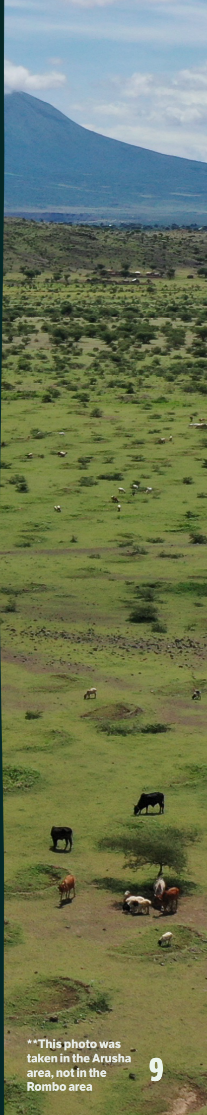
**This photo was taken in the Arusha area, not in the Rombo area