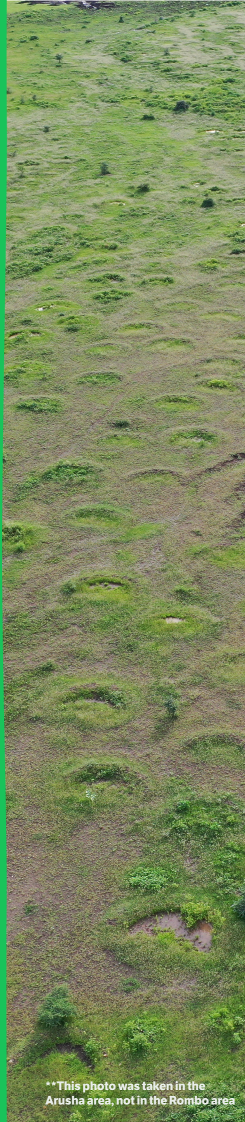
**This photo was taken in the Arusha area, not in the Rombo area

We are thankful for the support of our partners, who enable us to do what we love: working together with local communities to give nature the boost it needs to restore itself and make the future look green again!