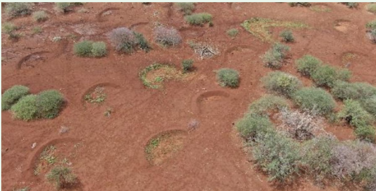
FIGURES 8 & 9: ROMBO BUNDS DRONE PICTURES IN MAY 2023 AFTER JUST ONE RAIN SHOWER