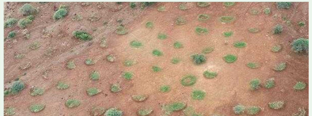
FIGURE 7: ROMBO BUNDS AFTER RAIN SHOWERS IN JUNE 2023