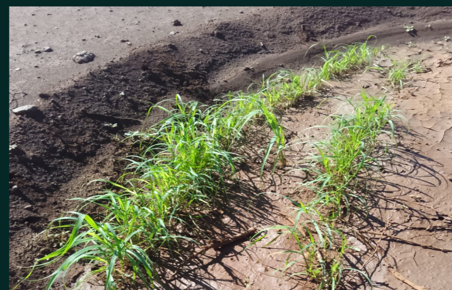
FIGURE 4: GRASS SPROUTED AND GREW INSIDE THE BUNDS AFTER APRIL 2023 RAINS

The digging of bunds was successfully concluded in January 2023, resulting in the construction of a total of 14,400 bunds. This achievement not only met the project's initial target of 48,000 bunds but also exceeded it by an additional 100 bunds. Simultaneously, the process of seeding the bunds was carried out. Drone photos showed germination and growth of vegetation after one rain rainfall event. Throughout the rainy season from March to April 2023, the region only experienced one rainfall episode. Drought conditions have continued to be a significant challenge and a threat to the local communities situated within the project site. As a result, this situation has increased grazing pressure in the bund sites.