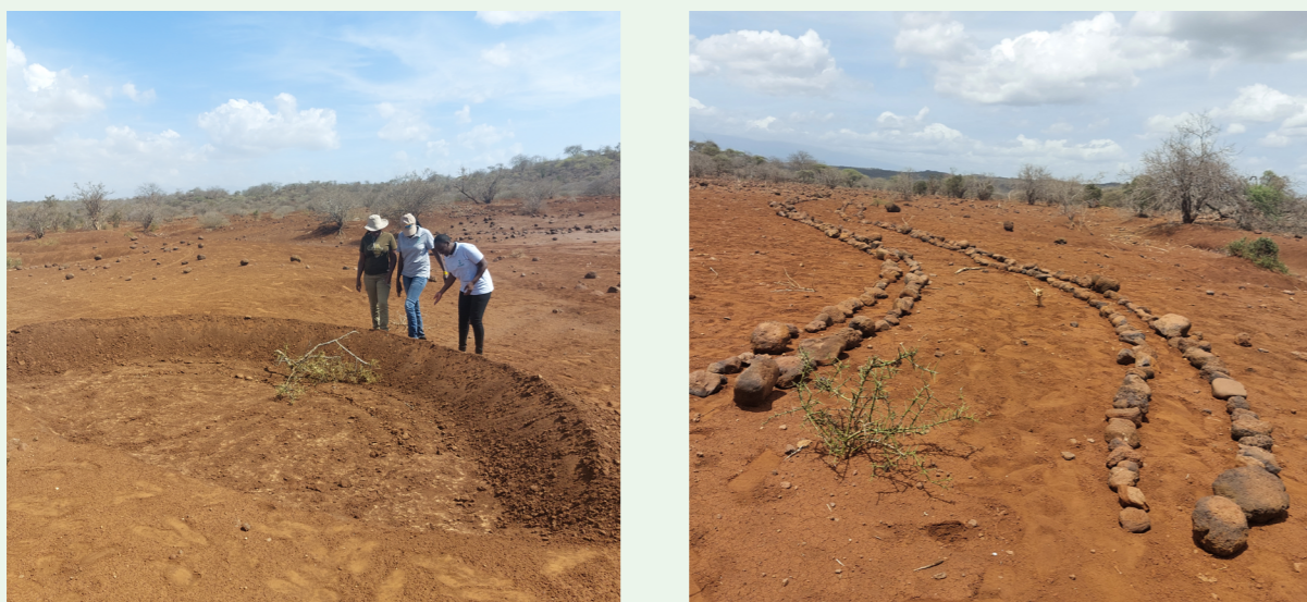
FIGURE 2 & 3: ROMBO BUNDS AND STONE LINES DURING BUND DIGGING IN JAN 2023

The project started in the second half of 2022. Since the digging started, over 48,000 water bunds have been dug in an area covering about 972 hectares of bare rangeland. The water bunds help in promoting soil and water conservation, which helps bring back vegetation, making more natural pastures available to the community, and creating a microclimate that in the long-term will alleviate the prolonged droughts faced by the communities. One rain shower was received during this reporting period and follow-up rains were needed but did not occur. We are hoping for better rains towards the end of the year when the next rainy season is expected!