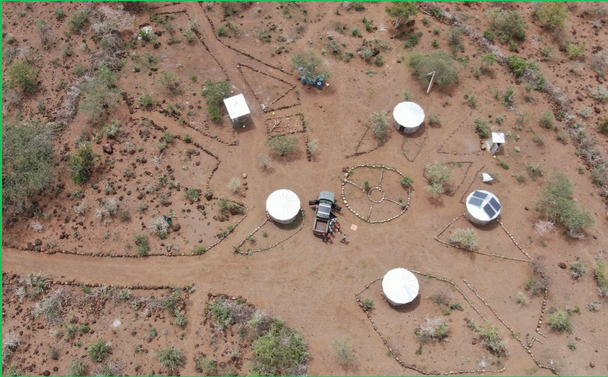
FIGURE 5: ROMBO RANGERS POST INSIDE THE BUND SITE