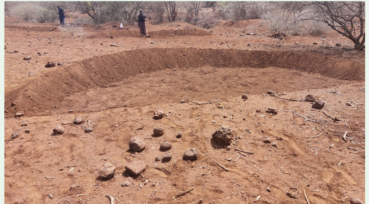
FIGURE 6: A BUND IN THE ROMBO BUND SITE IS VERY BARE BEFORE THE RAINS IN JANUARY DURING THE DRY SEASON

The photographs below are taken on the Rombo bund site. The first one is captured in January prior to the rains, and the others in May after the rainfall. These images visually highlight the transformation and impact of the project's efforts!